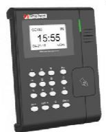
Proxy Card Clock