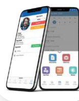
Employee Self-Service App