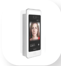
Biometric Facial Clock