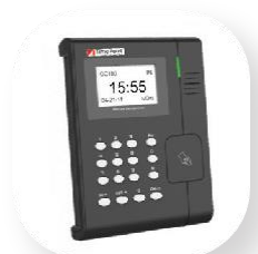
Proxy Card Clock