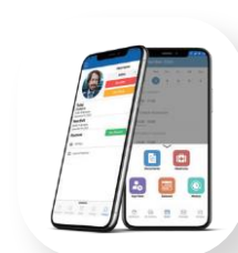
Employee Self-Service App