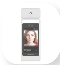
Thermal Facial Clock